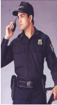
Security personnel level 1 costume

Combat NPC- Security personnel level 2 (Moderate armor)