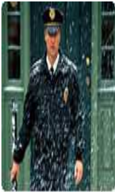
Security personnel level 2 costume

Combat NPC- Security personnel level 2 (Moderate armor)