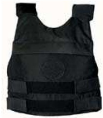
Body Armor- Light and Medium

Health - Health points to increase your health meter