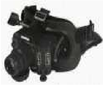
1 - ITT PVS-7D (64LP/MM) GEN 3 Night vision goggles