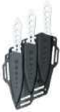
6 - Throwing knives stainless steel with holsters